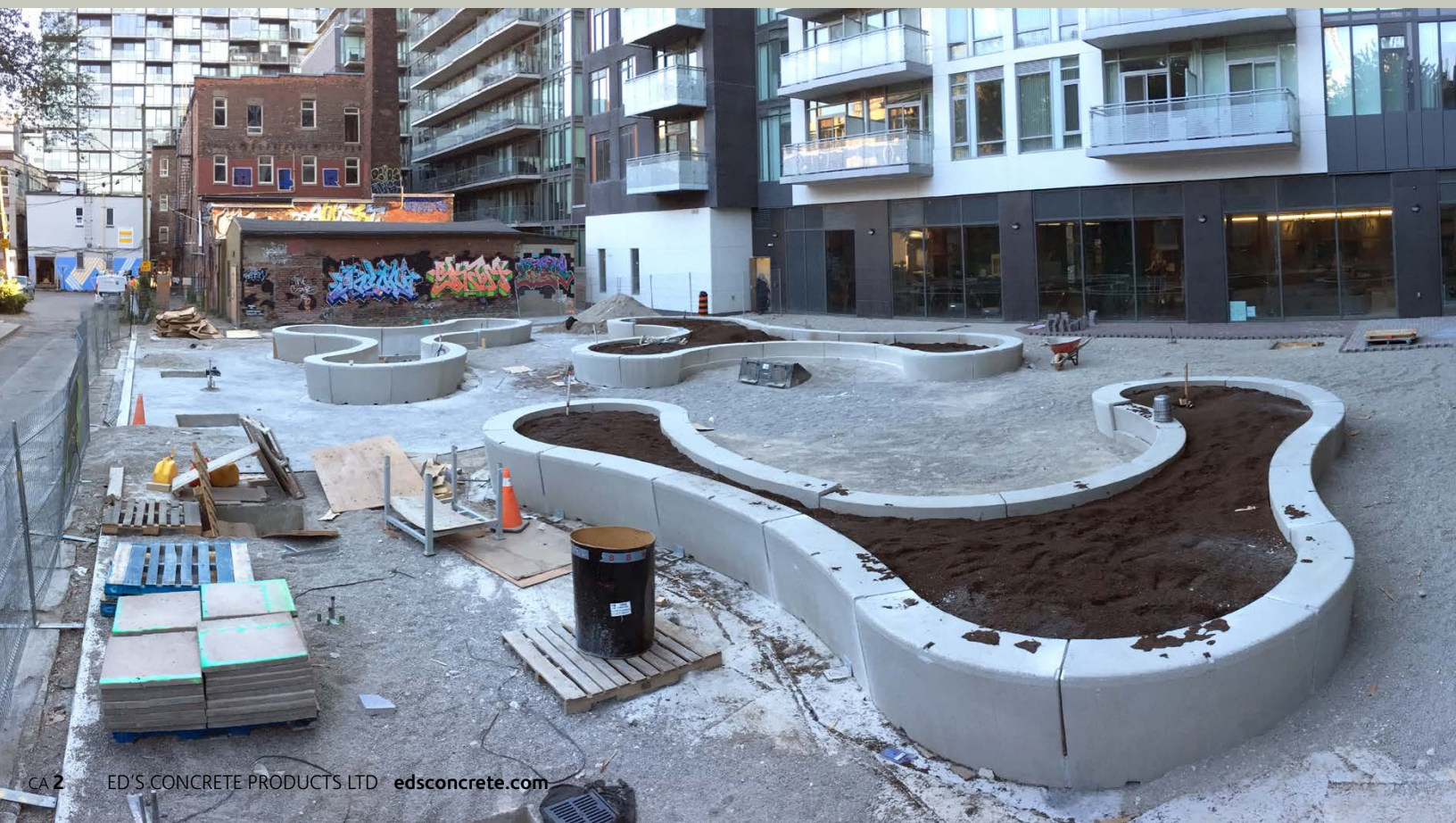
Musée Condominiums Landscape Architect: The Planning Partnership | Completed project, see page 3

Richmond Woods II Apartments Holiday Inn Express St Mary's Hospital Annex Woodstock Hospital