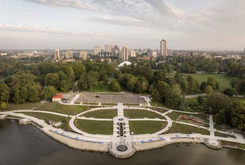
Waterloo Park (cover photo and above) Landscape Architect: Seferian Design Group